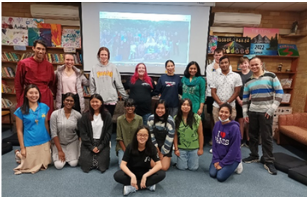
Pictured above: Antioch having their International themed day.

"It was at Antioch that the believers were first called Christians"